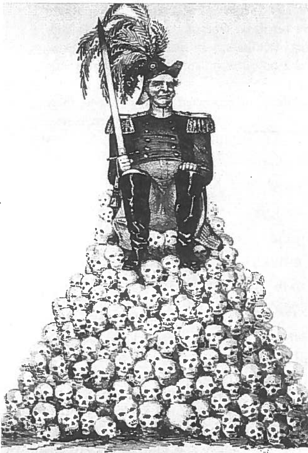
Presidential candidate Gen. Zachary Taylor sits atop a mound of skulls in this 1848 cartoon criticizing his role in the U.S. war against Mexico.