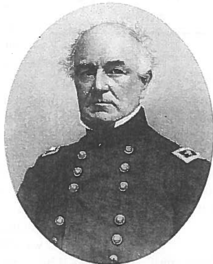
Col. Ethan Allen Hitchcock

Ordering troops to the Rio Grande, into territory inhabited by Mexicans, was clearly a provocation. Taylor's army marched in parallel columns across the open prairie, scouts far ahead and on the flanks, a train of supplies following. Then, along a narrow road, through a belt of thick chaparral, they arrived, March 28, 1846, in cultivated fields and thatched-roof huts hurriedly abandoned by the Mexican occupants, who had fled across the river to the city of Matamoros. Taylor set up camp, began construction of